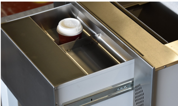
Tray insert with large coffee cup holder and cash tray.